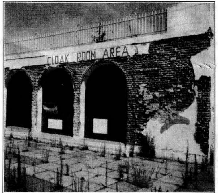
Finchley Swimming Pool - presently left to decay.