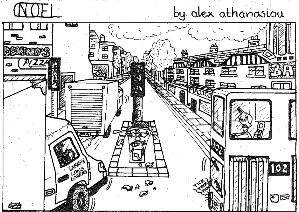
'Just another peaceful day for Bertie.'