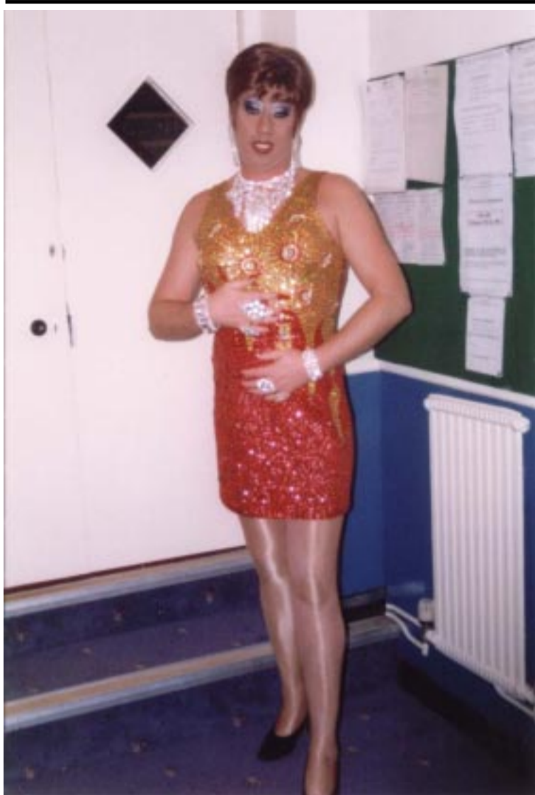
"Sophie" - the opening act.