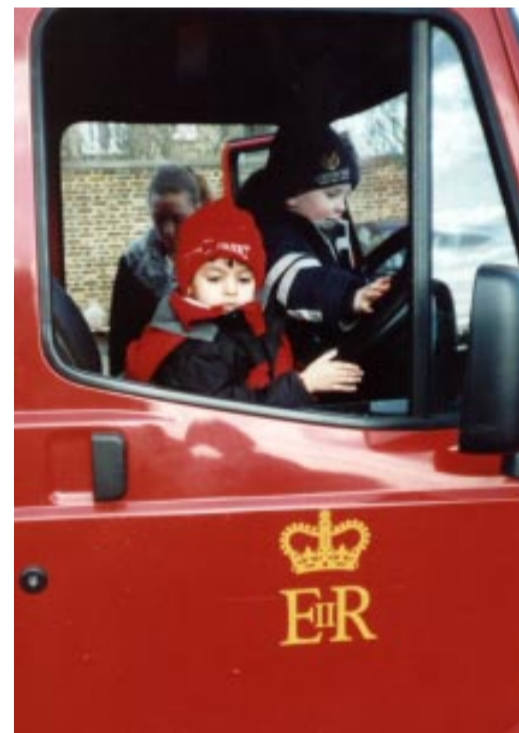
Martin School nursery children in mail van

Martin School's long-term lollipop lady is retiring from her crossing duties in April and will be much missed.