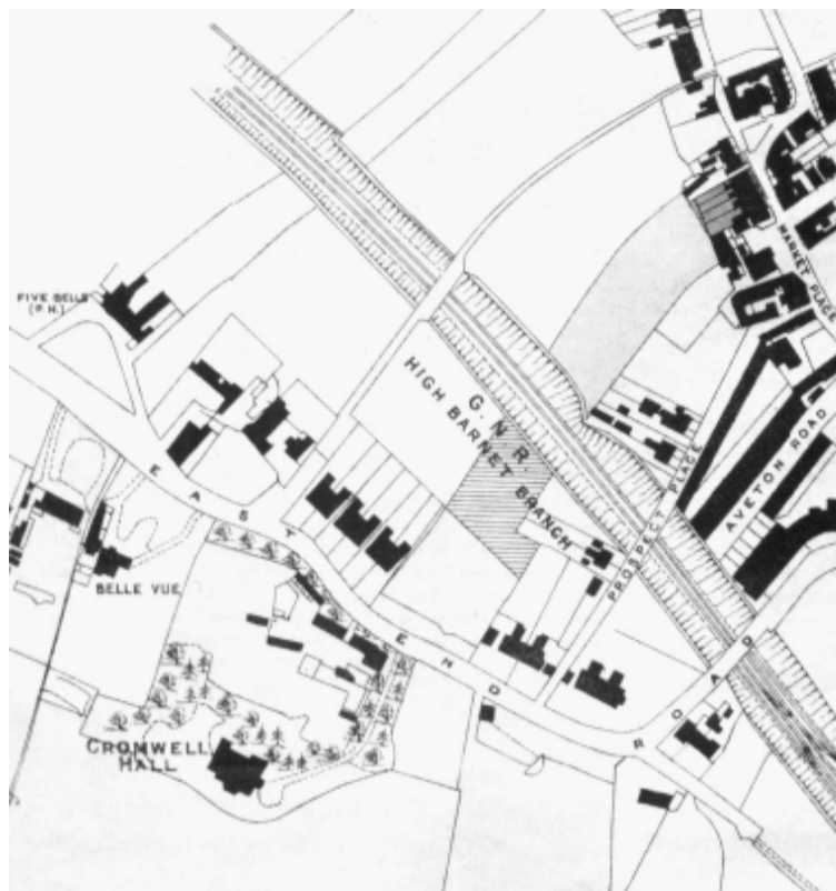
East Finchley in 1920 with Aveton Road on the right

Archer footnote:- Aveton Road used to stand where Prospect Ring is now (see map above). If this rings any bells, either contact Peter Keating by e-mail, or send your message via us.