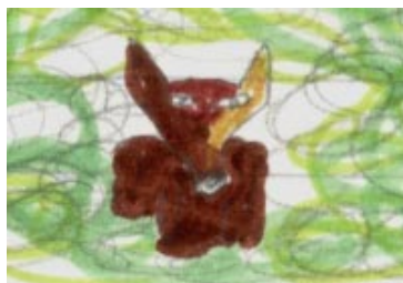
Fox by Aimee Hancock Gough with a little one - a cub."

"Because we were going to France, we had to get up early at 4am. There was a hole in the hedge. We were sitting in my car warming it up when a fox came out of the hole in the hedge. It went back in, then it came out again. It stayed for a moment, then it went into my garden. My mum had to drive very slowly in case it ran out again. I looked back and another one came out