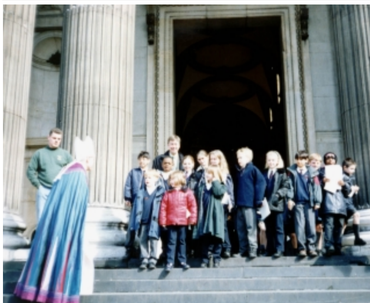
Holy Trinity School children meet the Bishop of London