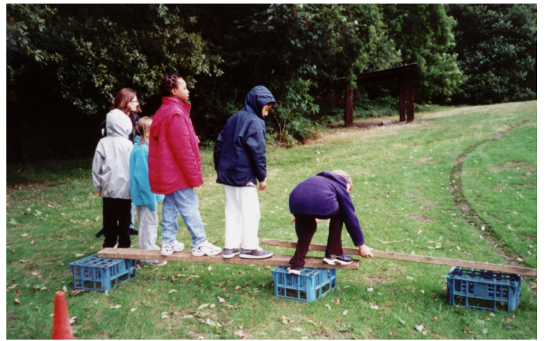
Holy Trinity children bridge building at moat mount