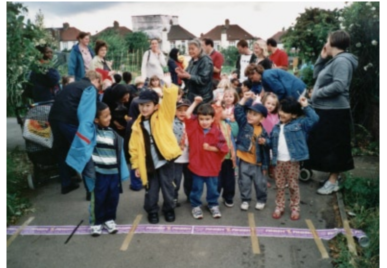
Sponsored toddle for Barnardos