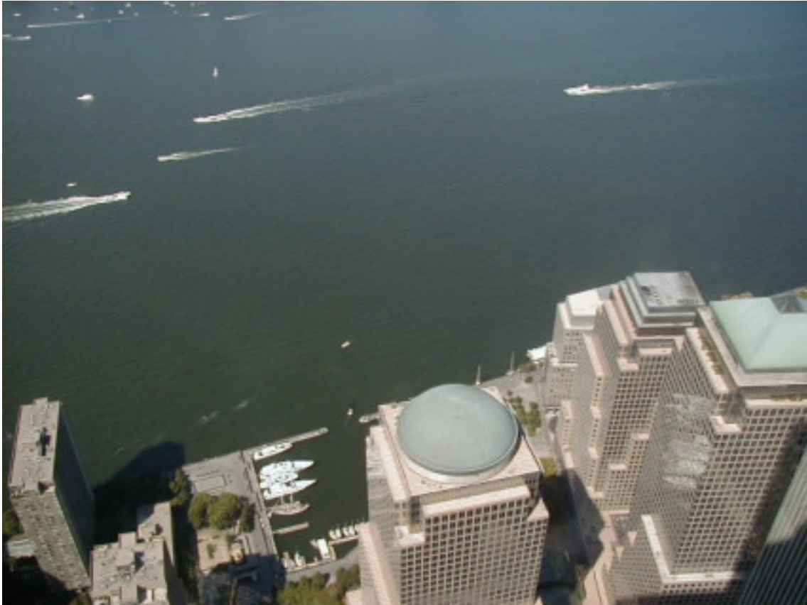
The last view from the Twin Towers just a couple of days before they were destroyed.