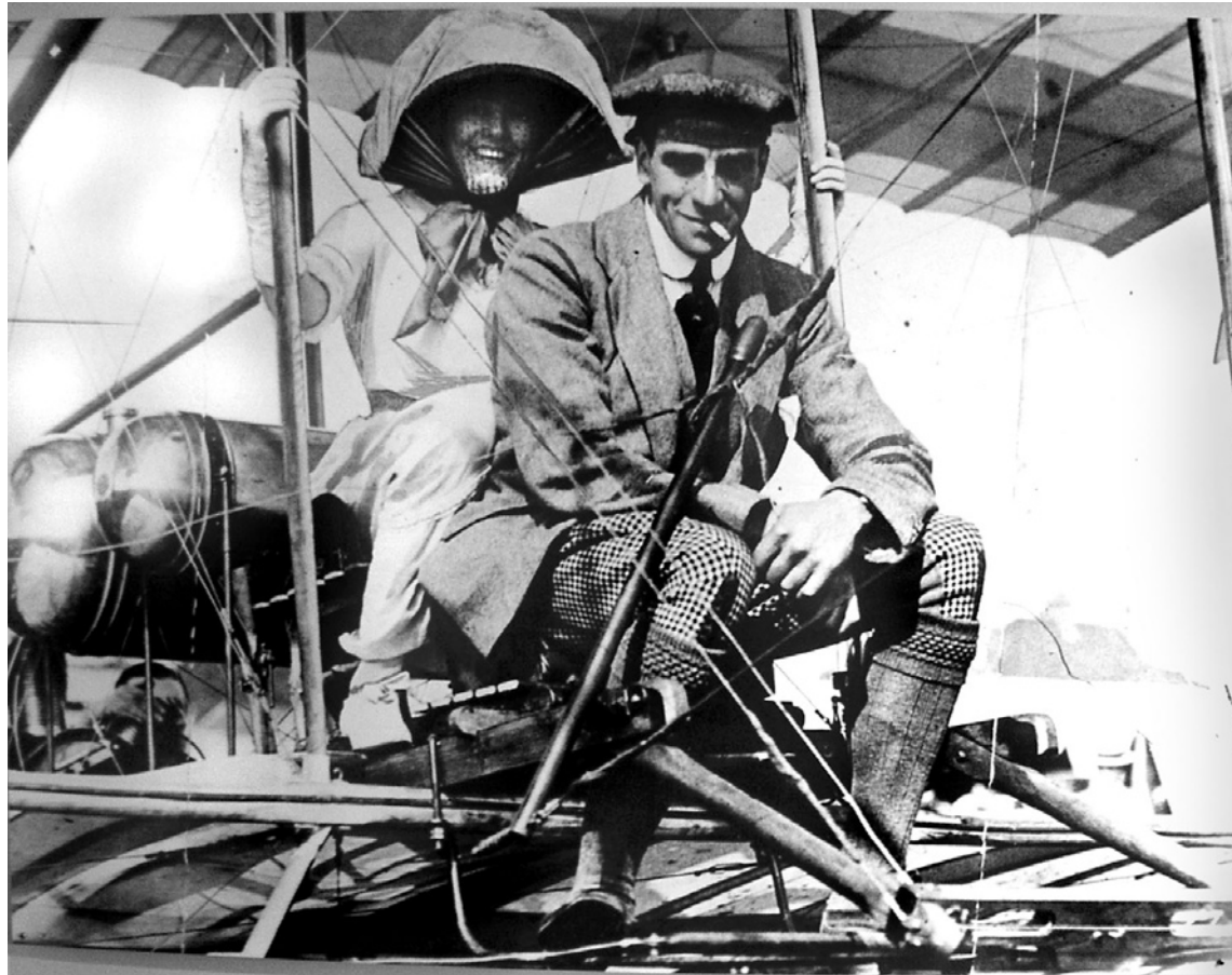
Claude Grahame-White with a lady passenger in a Farman biplane, c.1911.