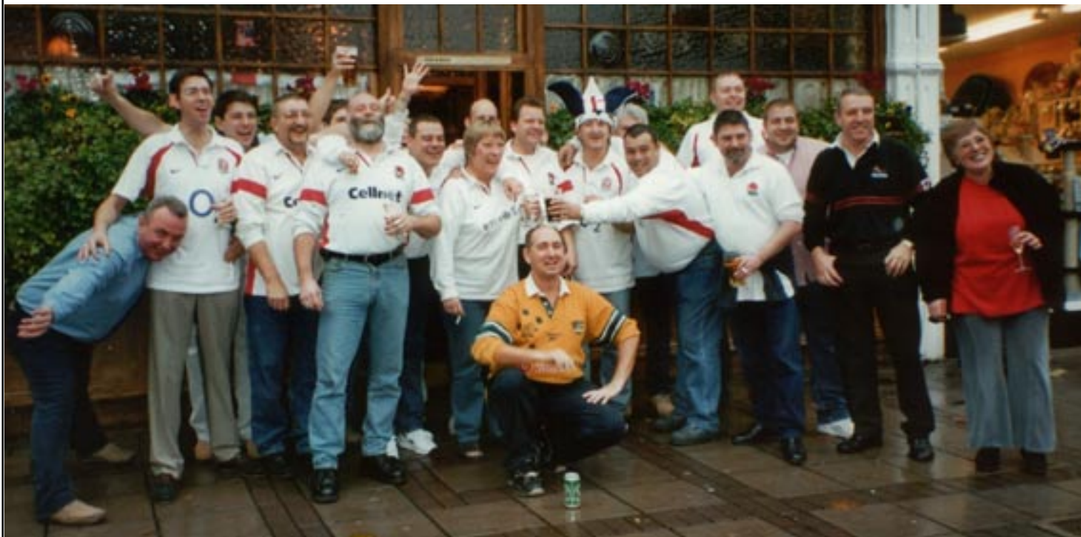
Rugby fans celebrate outside Maddens Ale House.