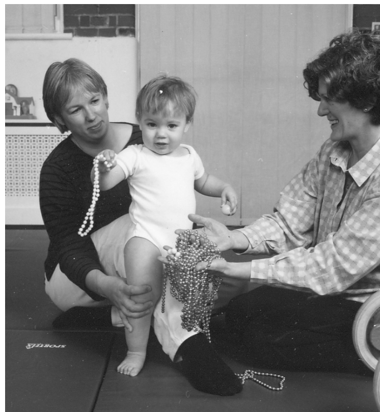
Physiotherapy

The Bobath Centre is a major training centre; high proportions of NHS therapists are Bobath trained. Bobath therapists work together as a team, combining their disciplines to improve the quality of posture and movement for each child. The whole family participates in ongoing activi-