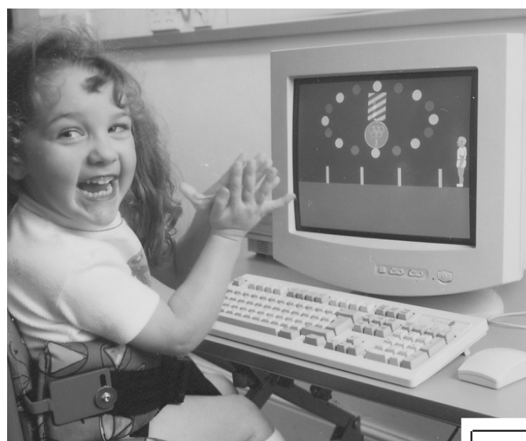
Communications skills used in speech & language therapy

would like to visit the Centre, please contact Vicki Stanton at The Bobath Centre, Bradbury House, 250 East End Road, London N2 8AU or telephone 020 8444 3355.