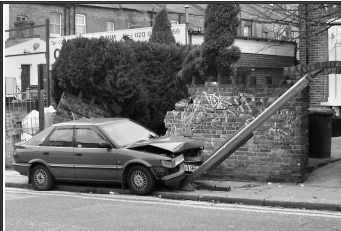
At least they would not have far to go to get the bus!

Let us hope that this positive attitude will continue and that the Head teacher and staff carry on helping to raise these young people's achievement.