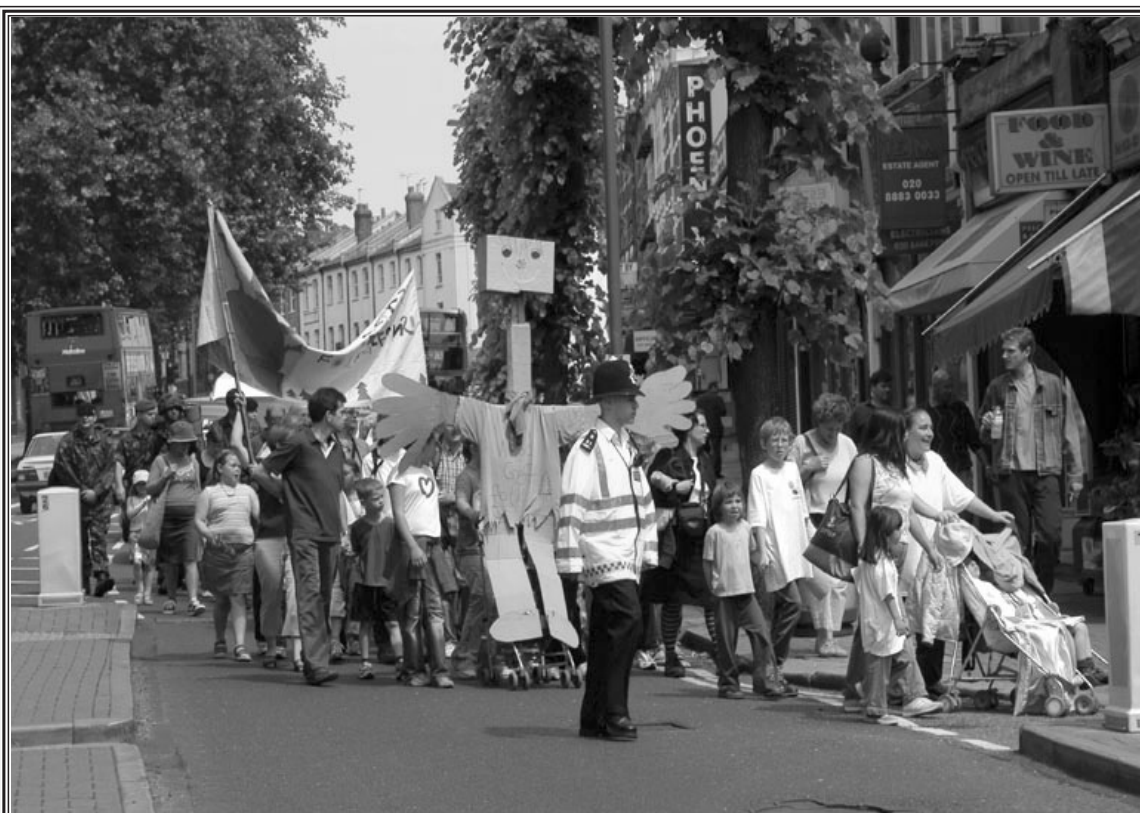
Crowds follow the procession into Cherry Tree Wood for the East Finchley Festival.

A community newspaper for East Finchley run entirely by volunteers.