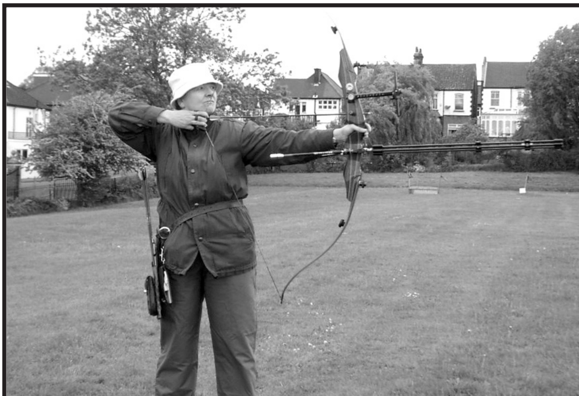
Right on target - a member of Aquarius Archers Club.

A community newspaper for East Finchley run entirely by volunteers.