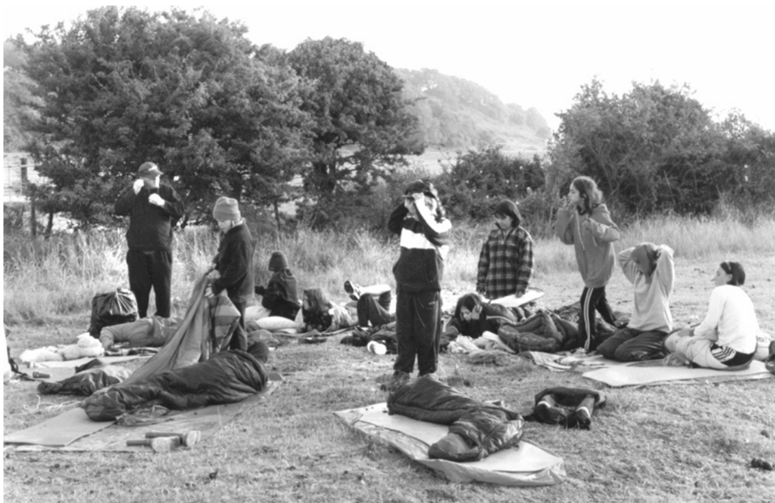
Sleeping bags al fresco at last year's camp.

Published by East Finchley Newspapers, P.O. Box 3699, London N2 8JA. www.the-archer.co.uk