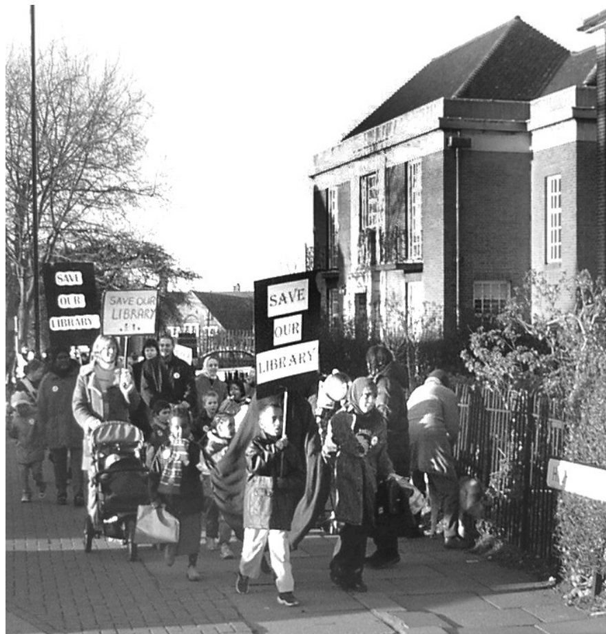
The head of the protest march reaches East Finchley Library.