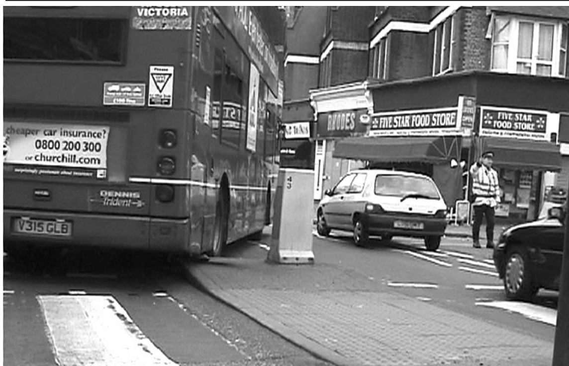
The back of a bus scales new heights, but can't get down.

A community newspaper for East Finchley run entirely by volunteers.