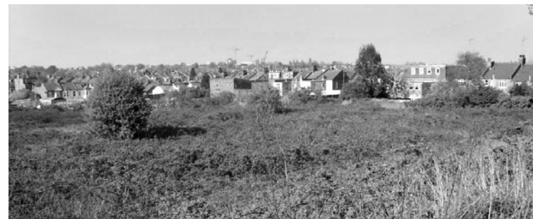
Long Lane Pastures await attention.

Following the decision to dispose of three of its buildings for £12.5million, Barnet Council has decided not to sell Long Lane Pastures to Fairview New Homes for housing development.