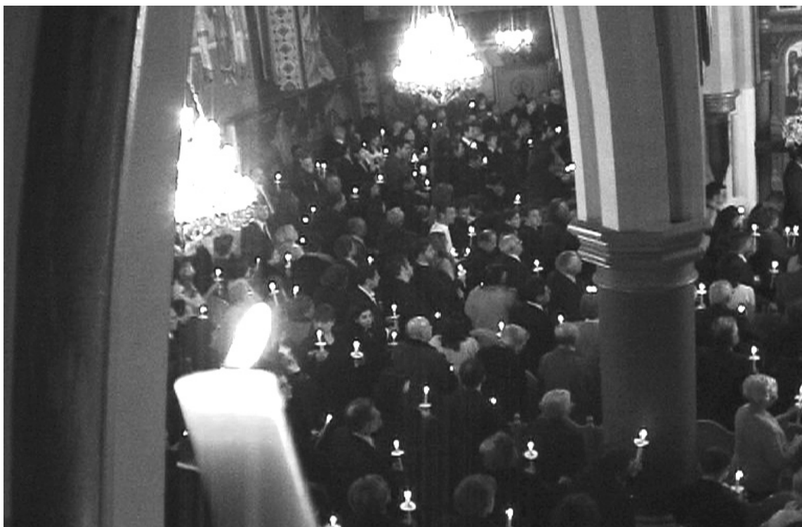
Holy light is distributed and the bells toll at St Andrew's in Kentish Town and (below) Easter-eggs Greek style - with 'flaounes' cakes in the foreground.

Published by East Finchley Newspapers, P.O. Box 3699, London N2 8JA. www.the-archer.co.uk