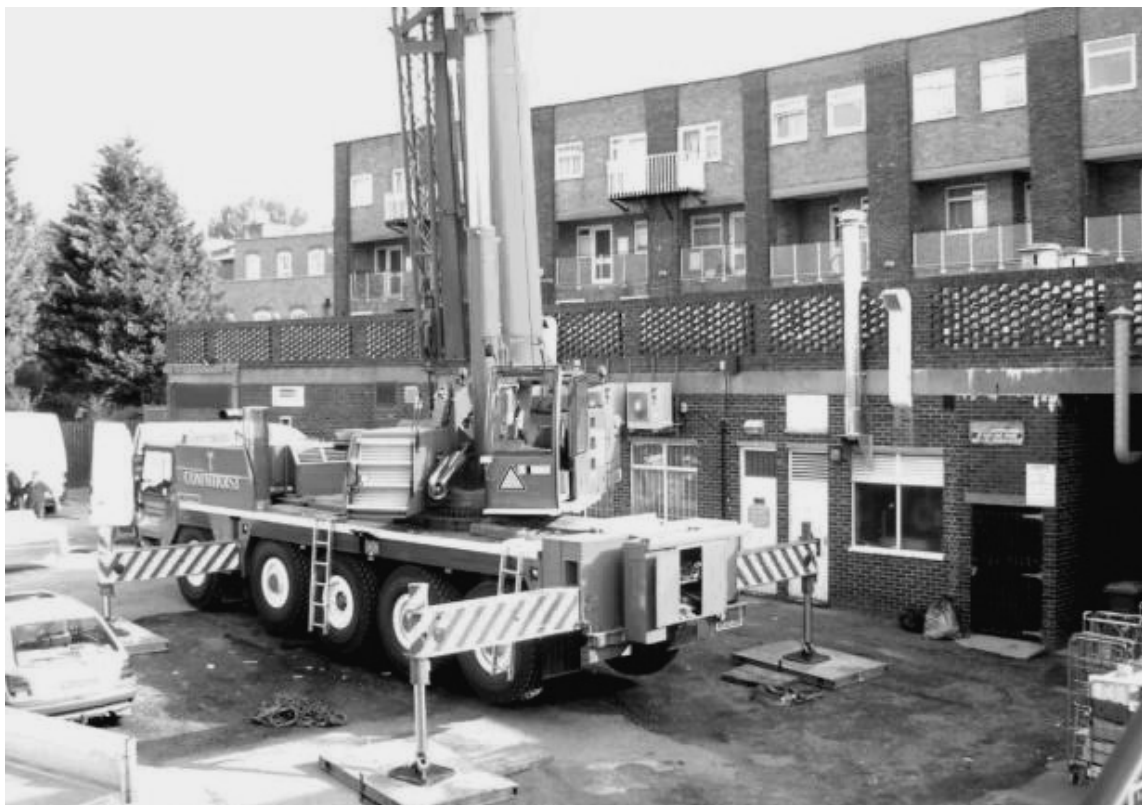
Another unwelcome presence in the car park behind Viceroy Close - See this month's Soapbox on page 11.