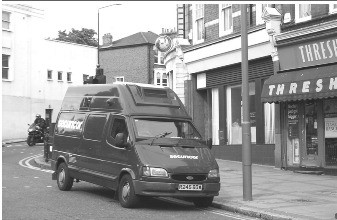
Armed robbers held up this Securicor van outside Barclays Bank in the High Road.

A community newspaper for East Finchley run entirely by volunteers.