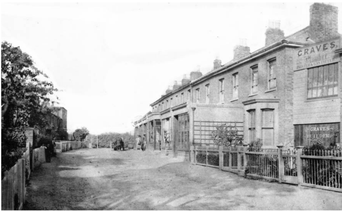
Church Lane as it used to be