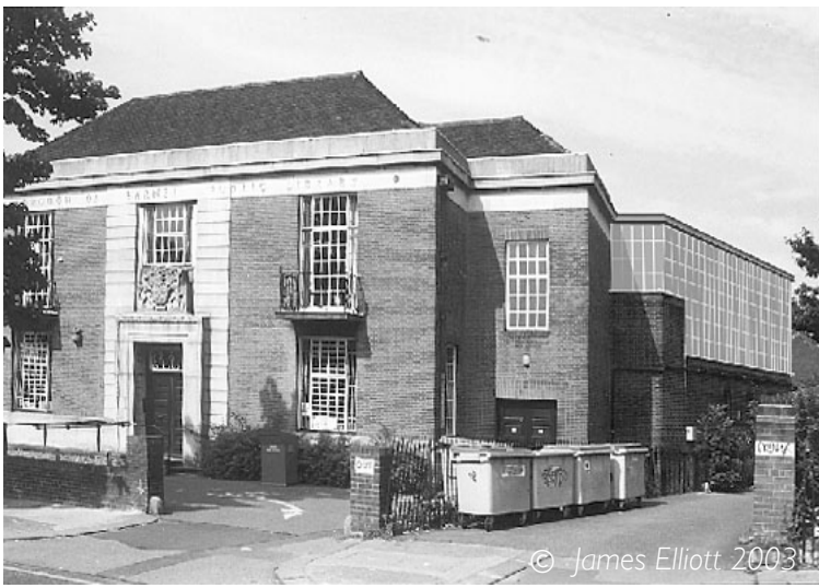
Front view of the library showing proposed extension taken from James Elliott's extension proposals