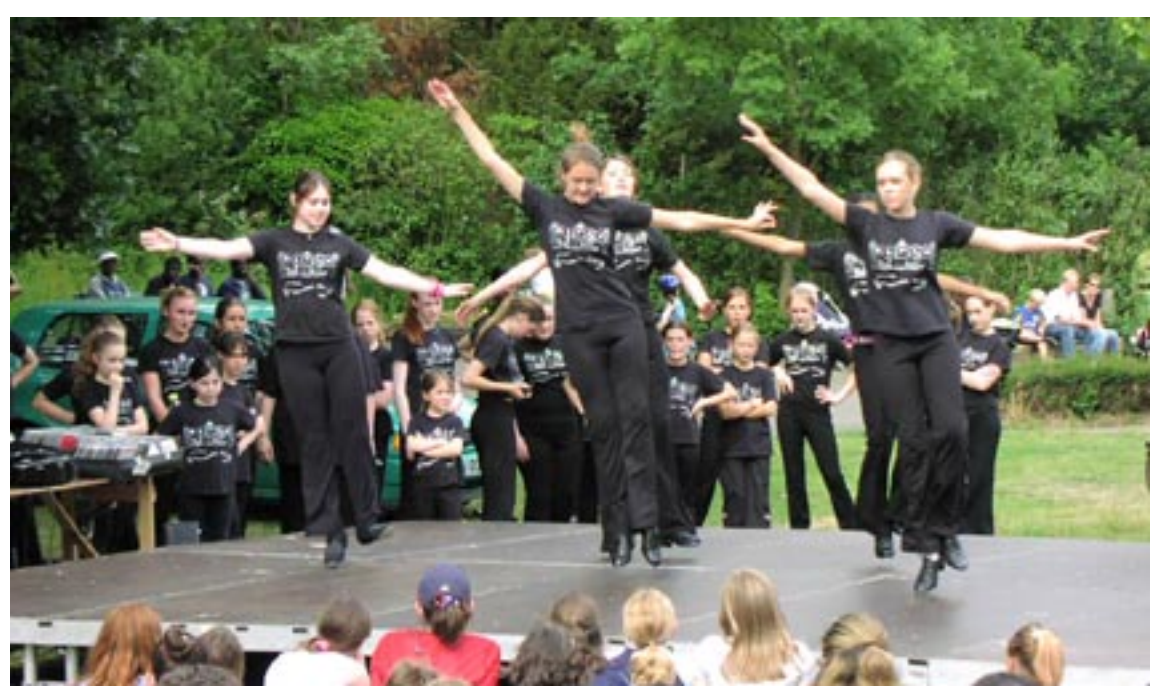
Best foot forward: Another overlooked dance group, North London Performing Arts at a previous year's festival.

This year, as an experiment, the second stage was handed over to two East Finchley residents who ran a successful festival last year in Leeds, called the Masterpeace Festival. Organisers said the reasoning behind this was to improve the artistic quality of