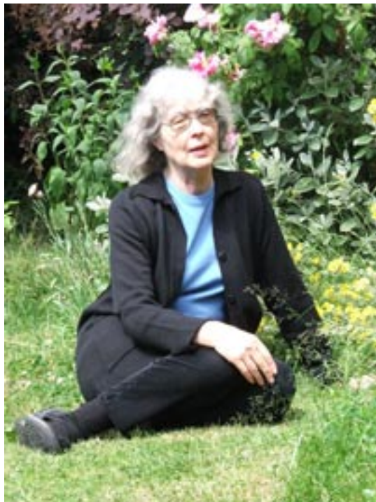
Fleur Adcock.

Fleur has also collaborated on a libretto and an opera, held several Fellowships and a writing residency, and works on poetry with teenagers in schools.