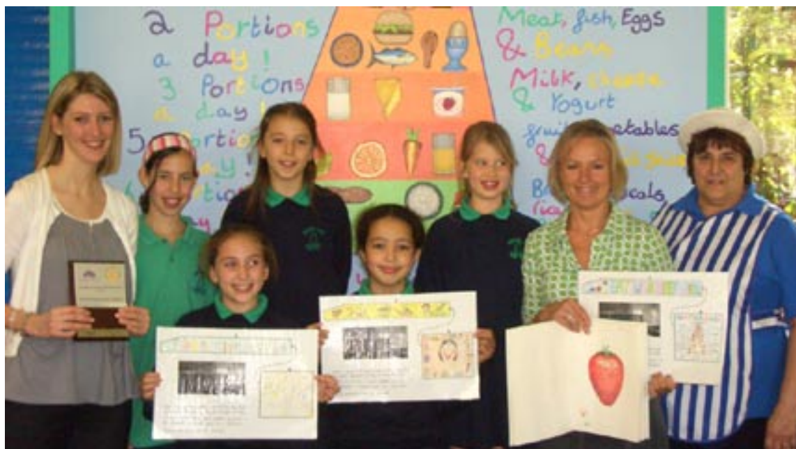
Brooklands pupils and staff celebrate their Barnet Healthy Schools Award

First prize will be a £20 Cherry Tree gift voucher and the two runners-up will each receive a £10 gift voucher. The deadline is 17 June so get creating. For more information pop into the shop or call 020 8883 4369.