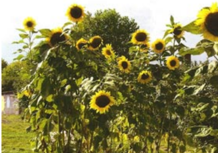
Sunflowers at Martin School.

Remember you should try to eat five servings of fruit and vegetables every day.