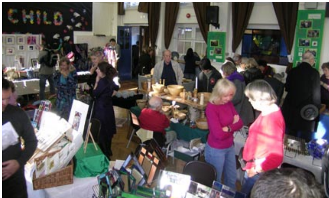
Visitors peruse the arts and crafts on offer at last year's EFO Art Fair.