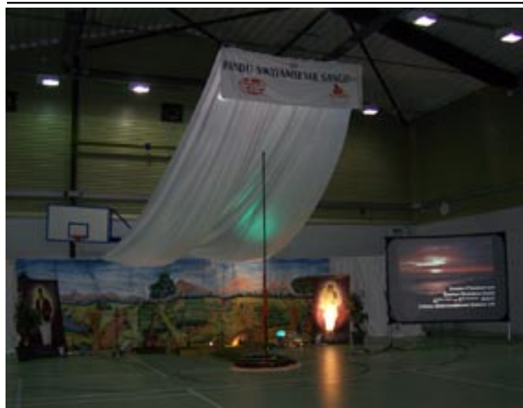
Bishop Douglass School sports hall transformed.