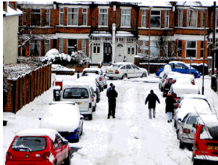
Snowball fights in Sedgemere Avenue. Calendar photo by Craig Johnson