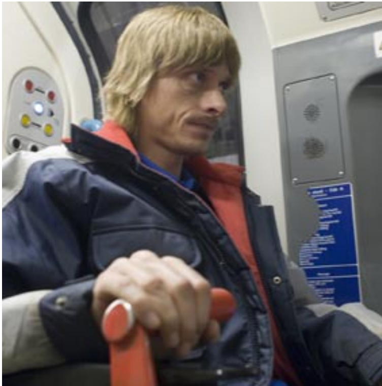
Mackenzie Crook turned tube driver at East Finchley station for his new film.

A community newspaper for East Finchley run entirely by volunteers.