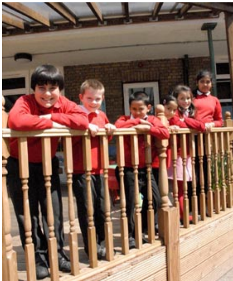
Manorside children are all smiles at their school's Ofsted report.

Commenting on the way that children from such diverse backgrounds play so well together, the inspector quoted a parent who said, "There is a genuine community feel to