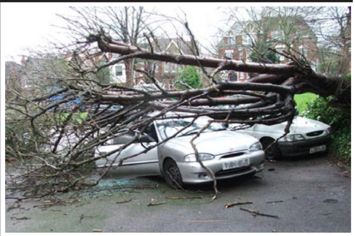
Recent high winds caused a tree to fall on this car.