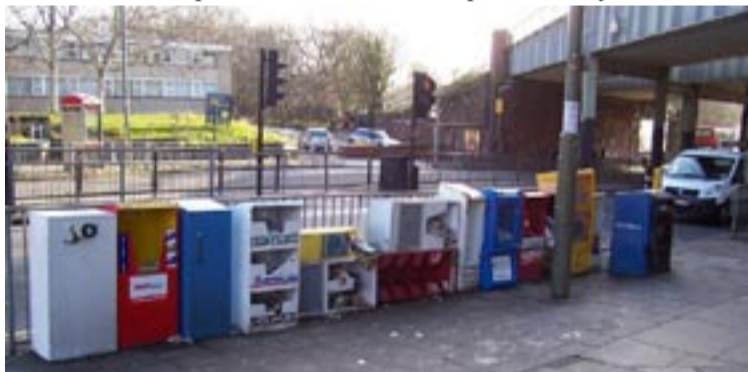
Spot the difference. Above: how it was, and below: a better welcome to East Finchley.

Barnet Customer Services seems to have done the trick. Not only has the litter been cleared away, but some of the stands have been removed too. So well done to those responsible for cleaning the place up and let's hope people manage to keep it that way.