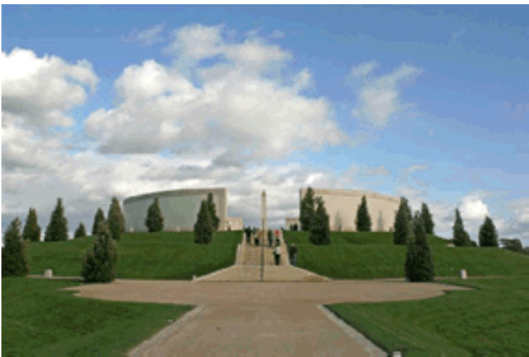
Armed Forces Memorial.