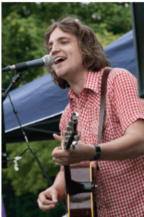
Starsailor's James Walsh

The annual event at the school in East End Road on Friday 10 July provided many attractions for parents, pupils, teachers and friends, including an