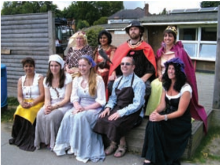
Tudor style at Tudor School.