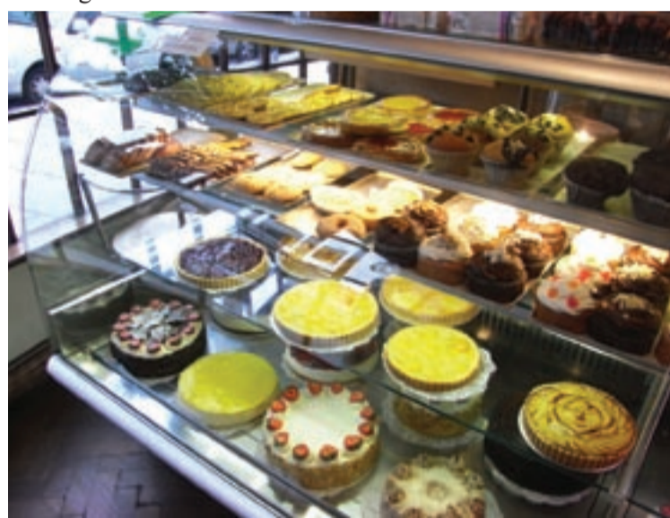
Decisions, decisions in Chorak by Sylvie Clarke is April's picture in our 2010 calendar.