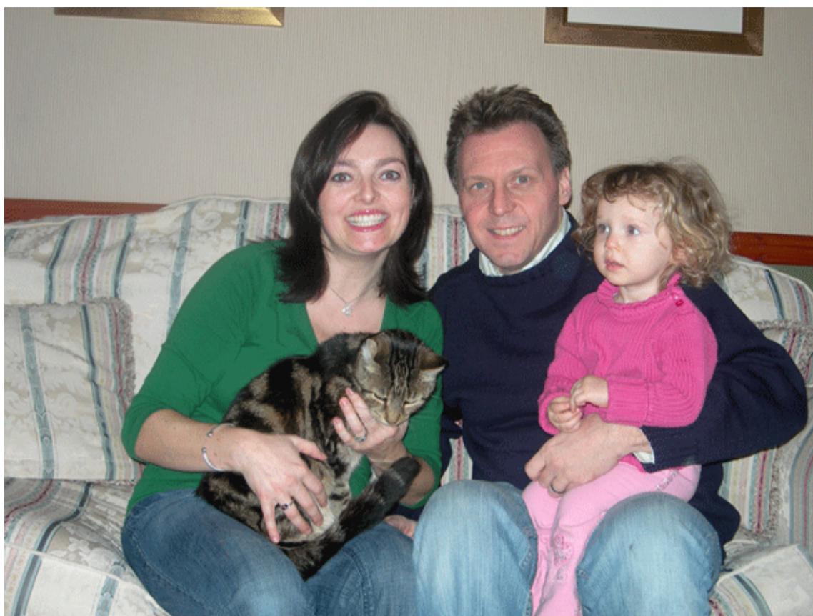
Charlie the cat safely back home with Rosie, Brent and India.

260 East End Road www.nickysharposteopathy.co.uk London N2 8AU e-mail: info@nickysharposteopathy.co.uk