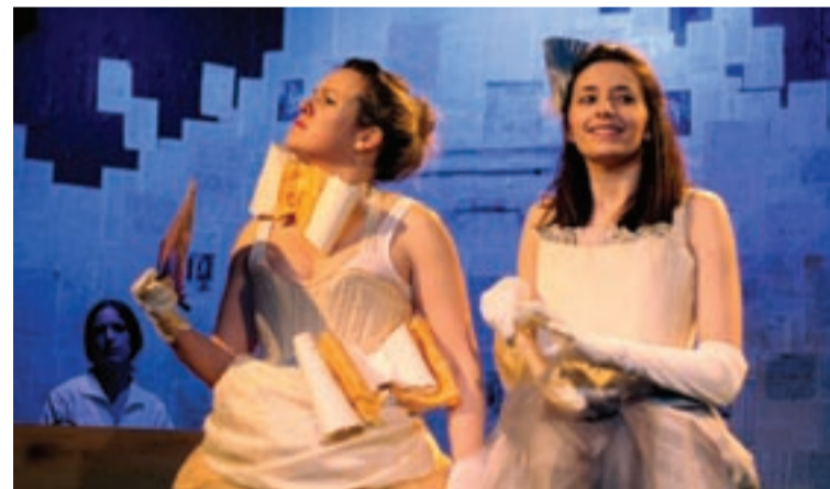
Women in the New World: a scene from the Fluff Productions drama.

As an all-female group, Fluff Productions' aim is to make a difference by tackling the lack of roles for women in theatre.