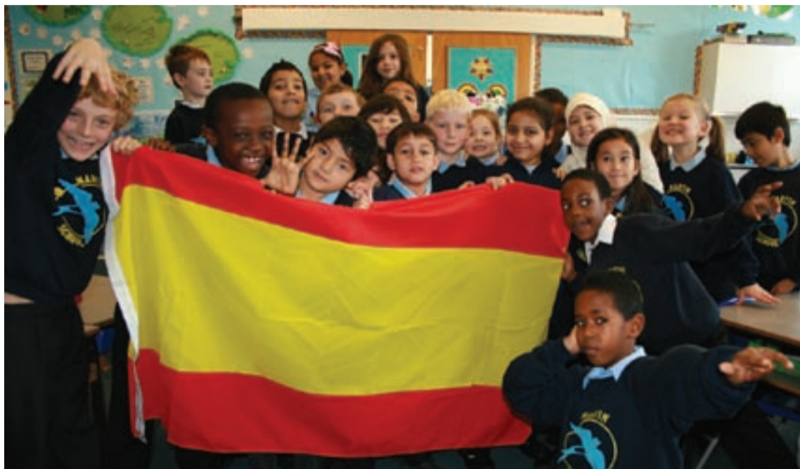
Children at Martin Primary wave the flag for international relations.

As we went to press, we learned that Barnet Council's cabinet resources committee on 30 November, which was discussing Stanley Field, may also be taking a decision about Park House, the long-vacant council property opposite the tube station. A decision is requested on letting it to third party organisations for a commercial rent. We will report in our next issue.