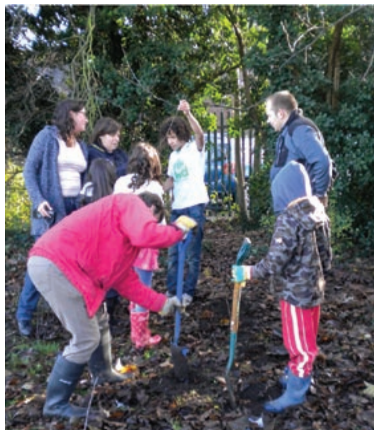
Martin School pupils.

They hope members and others may offer to join the committee and help to preserve the wood for the benefit of all and into the future. For more information, visit www.cherrytreewood.co.uk