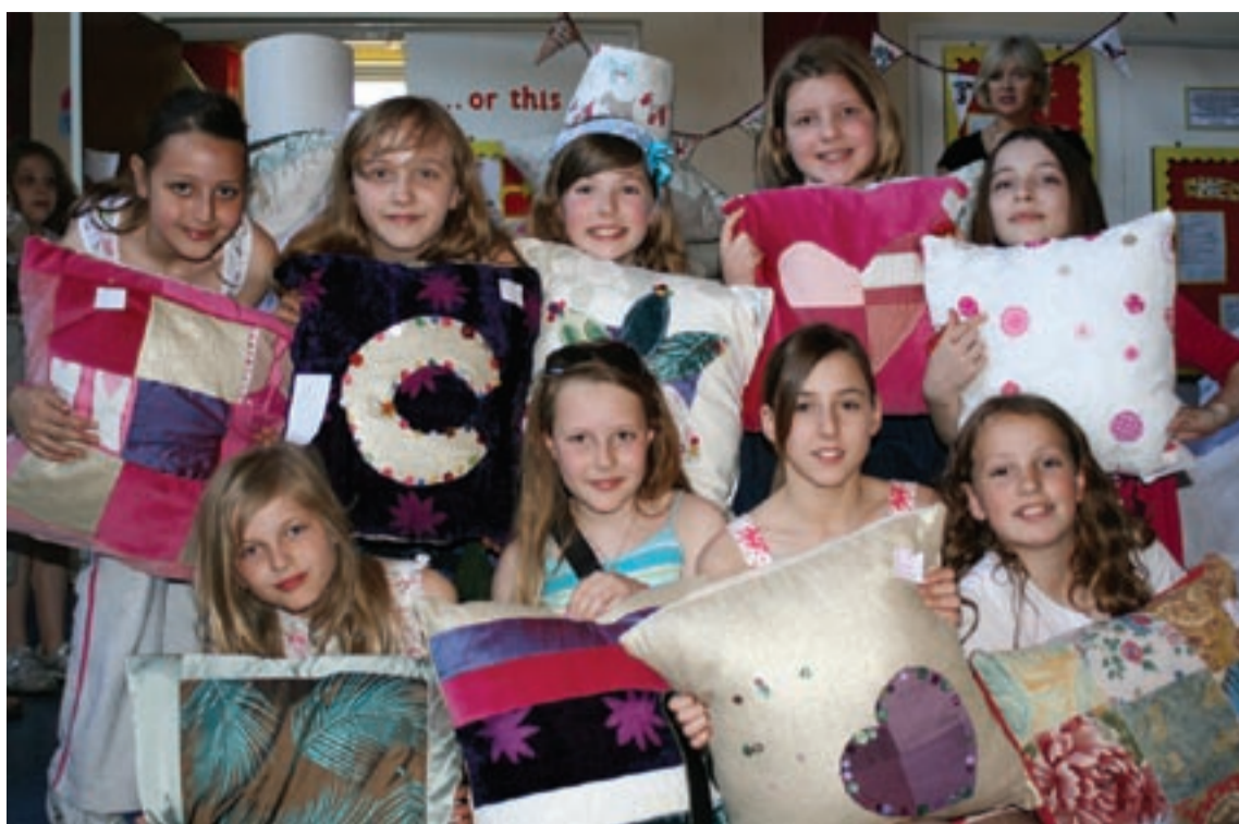
Cushy: the Year 6 girls from Holy Trinity School with their best-selling cushions.

East Finchley Electrical Contractors ▪ 115 High Road, East Finchley N2 8AG