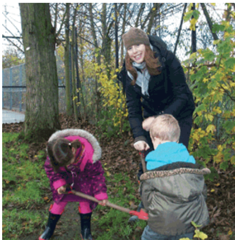
Pupils, staff and parents planted for the future at Holy Trinity.