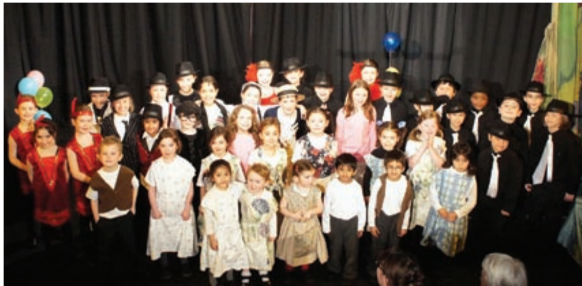
The cast of Wind in the Willows , another hit for Create.

Distribution takes place once a month. A typical round takes 30-45 mins to deliver. For details contact 020 8883 0433 or the-archer@lineone.net