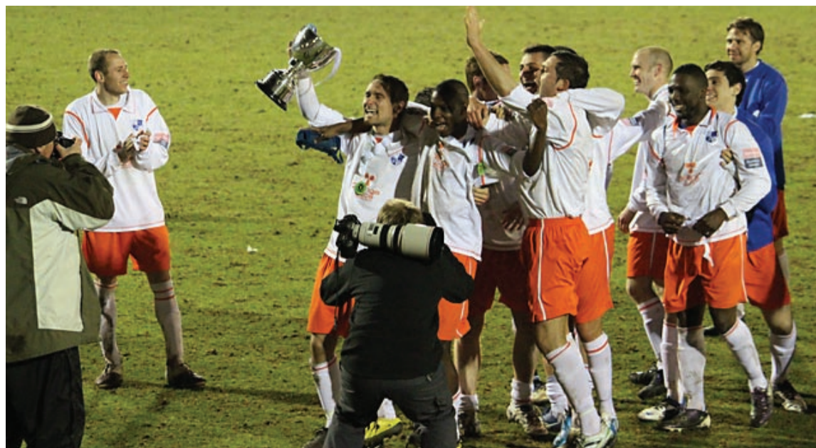
Wingate & Finchley celebrate their cup win.

The next open meeting of the action group will be held at the Green Man Community Centre at 7.30pm on 10 May. To get involved in the campaign, contact endofstrife@hotmail.co.uk , call 07870 647284 or see OBAG's Facebook page.