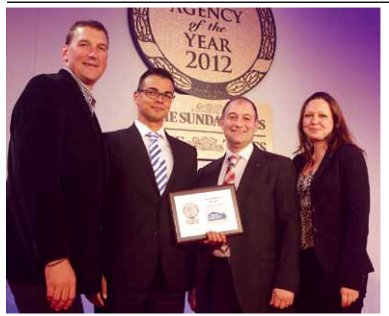
Double celebration for estate agent

Martyn Gerrard Estate Agents had cause for a double celebration when it marked its 48th year in business and on the following day won the Silver Award for best Medium London Agent at the Letting Agency of the Year