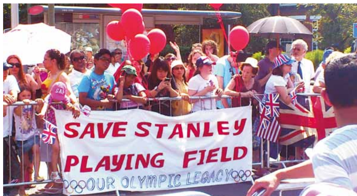
Waiting for East Finchley's Olympic Legacy.