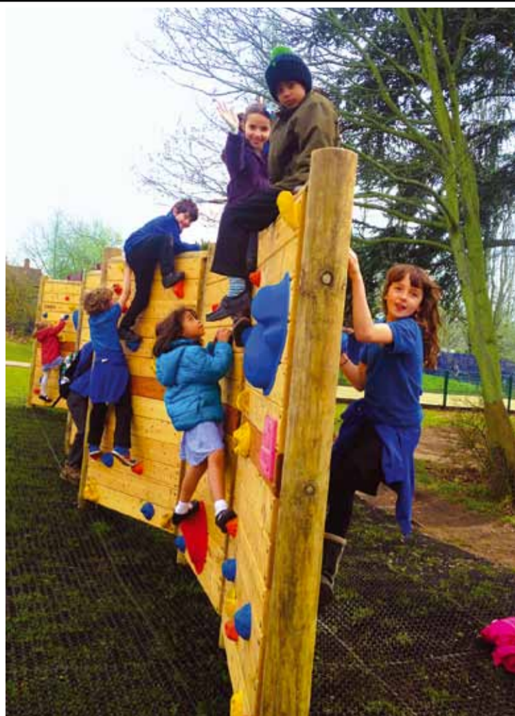
Children at Coldfall Primary School scale the heights of their new climbing wall.

For details on how to get involved please contact BBTN at: BBTN, The Studio, 11a Wetherill Road, London N10 2LS. Telephone 020 8883 8008 or email BBTN@talktalk.net