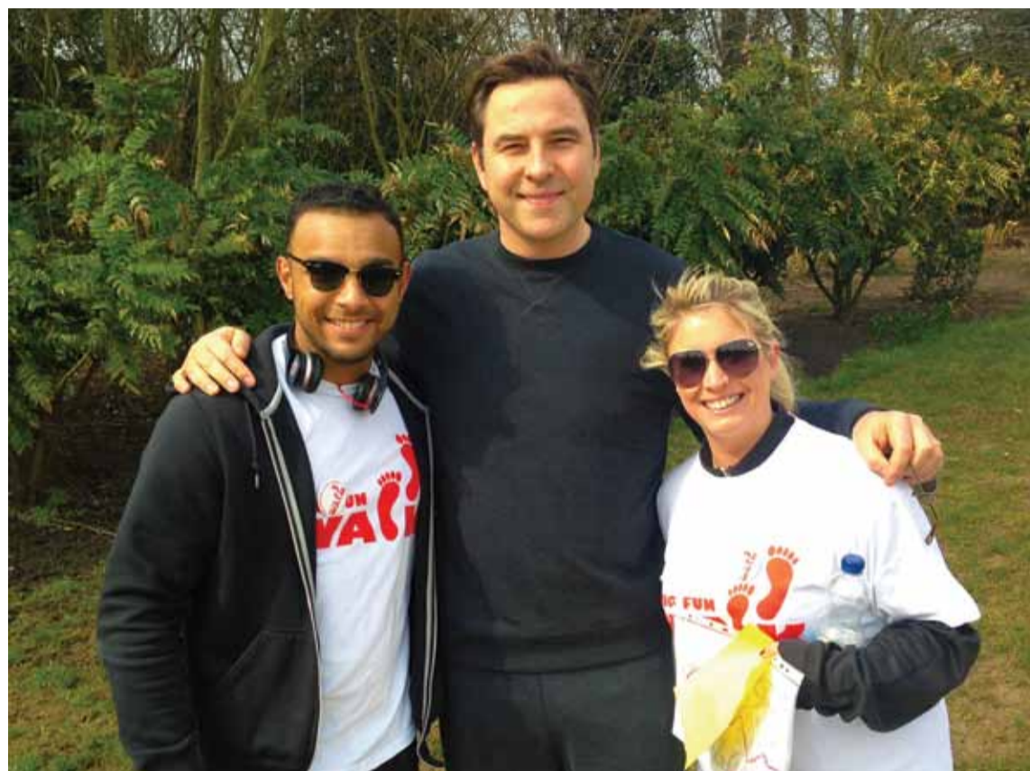
TV star David Walliams with two of the Big Fun walkers.

Anyone with any information should contact DC Mess on 020 8358 1751 or ring Crimestoppers on 0800 555 111 if you want to remain anonymous.