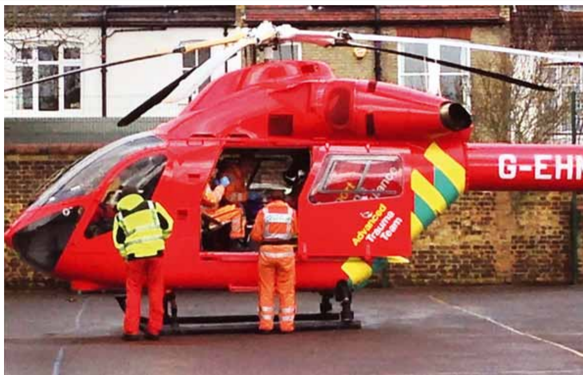
The air ambulance prepares for take-off from Manorside School's playground.

They have raised further concerns about the future of the SLOL after the archery club based on the open green space that forms the covered reservoir stated its intention to build a larger, brick club house after their wooden 1930s club house was destroyed by fire.